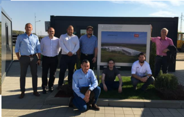
Projectteam at locatin