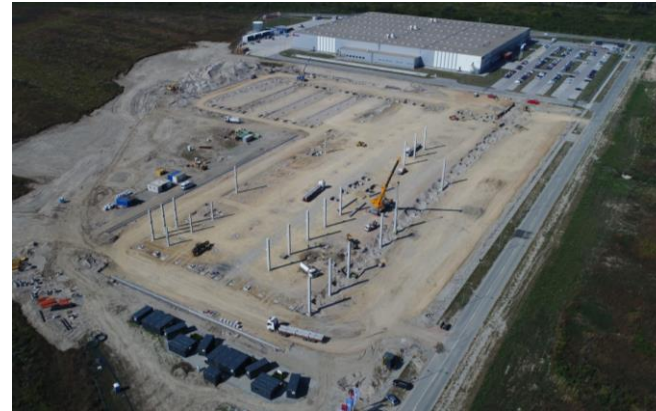
Start of construction in late summer 2019