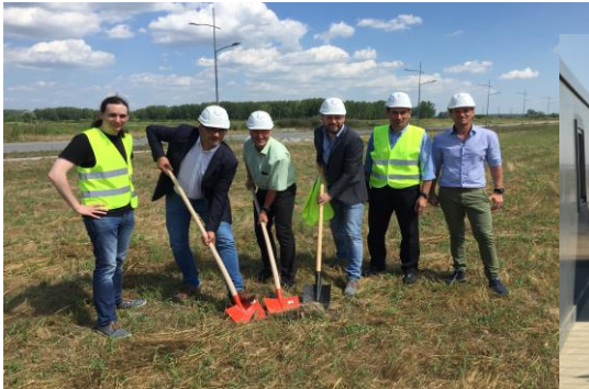
Ground braking on 28.08.2019

Project proceedings (link: documentation of const. company )