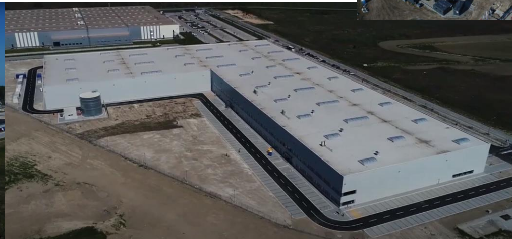
Finalization 04/2020 despite Covid 19 → (final plant status)